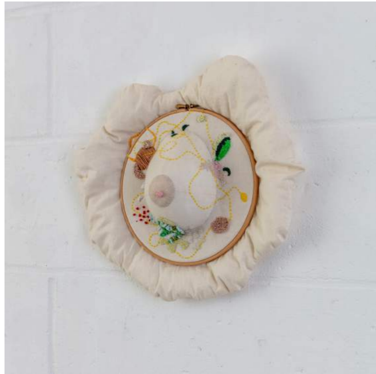
Silia Ka Tung Sunny Side Up (Snowberry) , 2020 Embroidery on Canvas, Embroidery Hook, Polyfill 42 x 37 x 10 cm