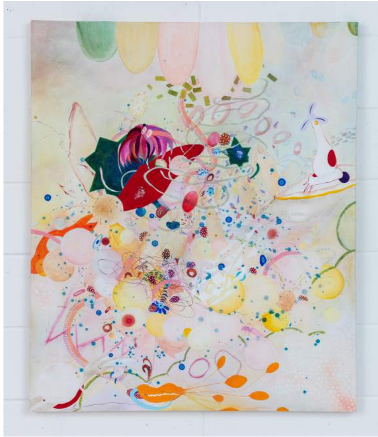
Silia Ka Tung Windmill , 2024 Acrylic on Canvas 120 x 100 cm