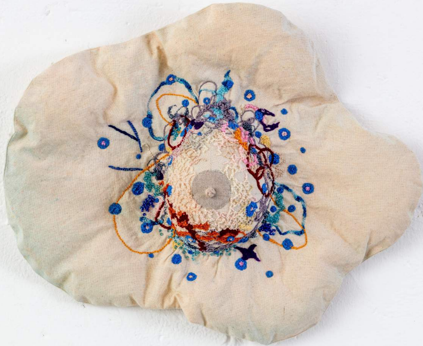
Silia Ka Tung Sunny Side Up (Blue Dots) , 2024 Acrylic & Embroidery on Canvas, Polyfill 37 x 31 x 7 cm