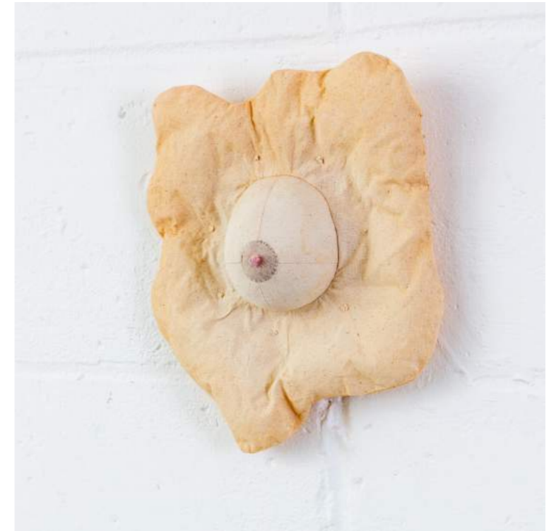
Silia Ka Tung Sunny Side Up (Ochre) , 2023 Acrylic on Canvas, Polyfill 22.5 x 25 x 6 cm