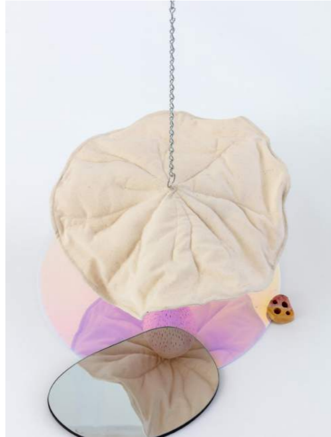
Silia Ka Tung Lotus Tears (Pink) , 2024 Textile, Metal, Mirrors, Ceramic Size variable