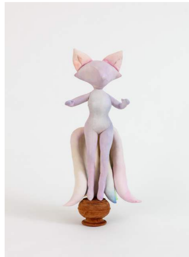
Silia Ka Tung Lady Fox , 2022 Acrylic on Canvas, Polyfill, Wire and Wood 70 x 33 x 24 cm