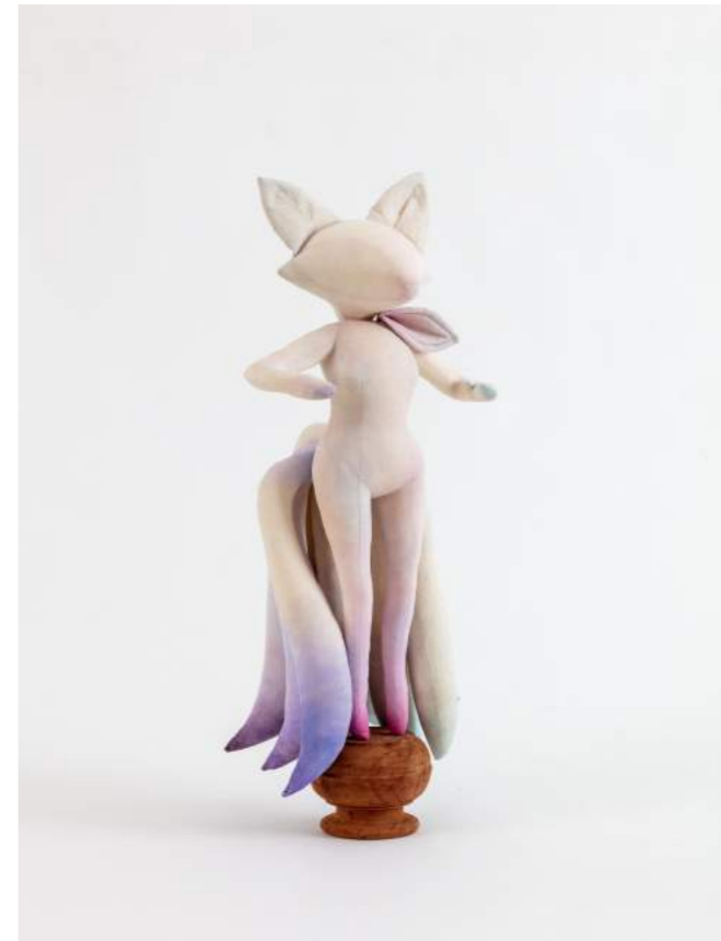
Silia Ka Tung Ms Foxy , 2023 Acrylic on Canvas, Polyfill, Wire and Wood 67 x 33 x 32 cm