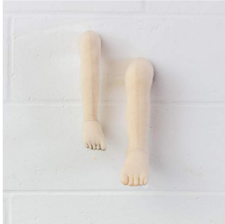
Silia Ka Tung A Prelude to Adventure , 2020 Canvas, Polyfill 45 x 25 x 19 cm