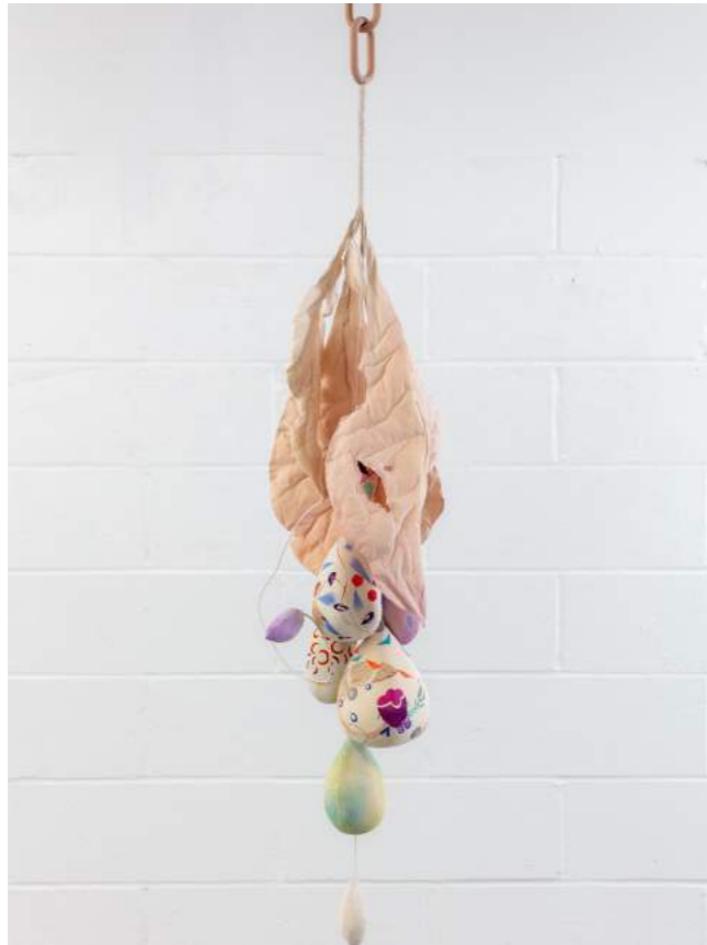
Silia Ka Tung String of Teardrops , 2024 Acrylic on Canvas, Polyfill, Wire, Wood 204 x 40 x 35 cm