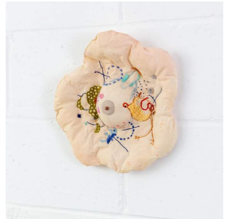
Silia Ka Tung Sunny Side Up (Yellow Bird) , 2024 Acrylic & Embroidery on Canvas, Polyfill 33 x 34 x 7 cm