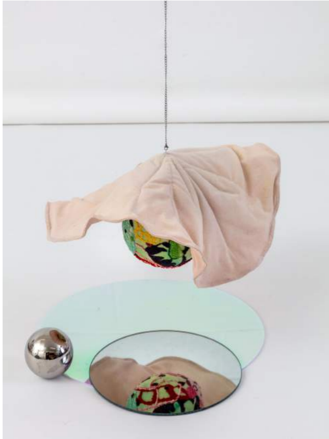
Silia Ka Tung Lotus Tears (Embroidery) , 2024 Textile, Metal, Mirrors Size variable