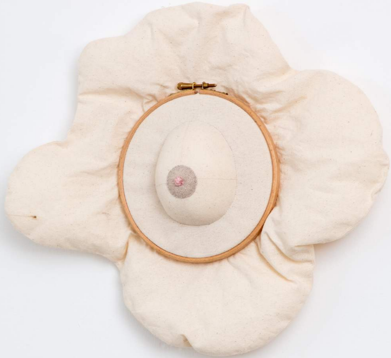
Silia Ka Tung Sunny Side Up , 2020 Canvas, Embroidery Hook, Polyfill 37 x 38 x 10 cm