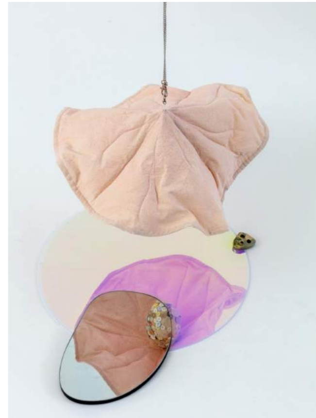
Silia Ka Tung Lotus Tears (Buttons) , 2024 Textile, Metal, Mirrors, Ceramic Size variable