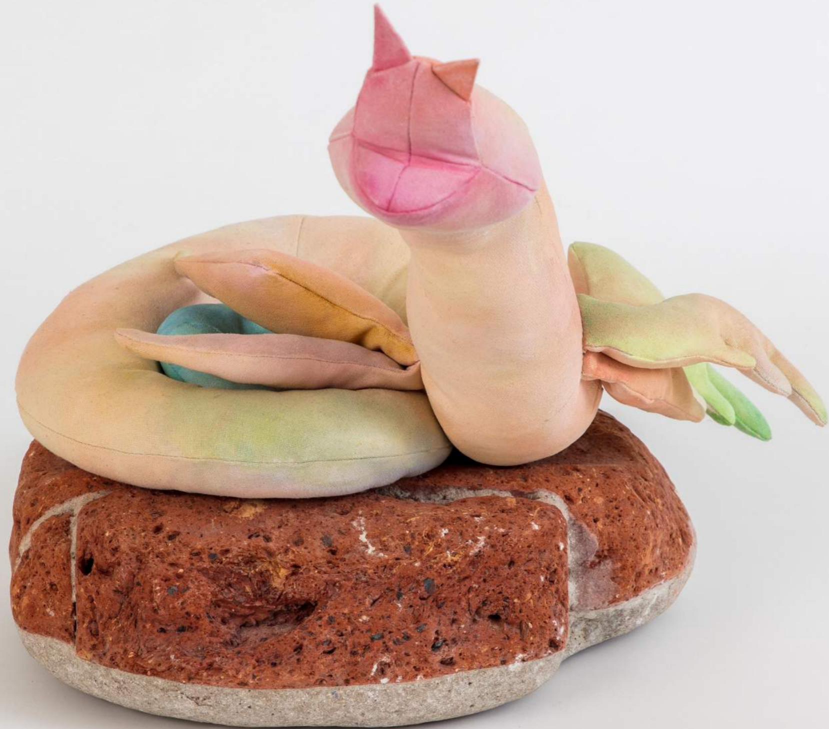
Silia Ka Tung Miss S , 2020 Acrylic on Canvas, Polyfill, Wire and Brick 32 x 47 x 34 cm