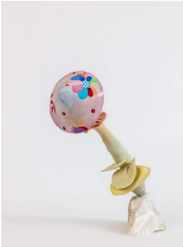
Silia Ka Tung Lady Reishi , 2022 Acrylic on Canvas, Polyfill, Wire and Quartz 60 x 27 x 14 cm