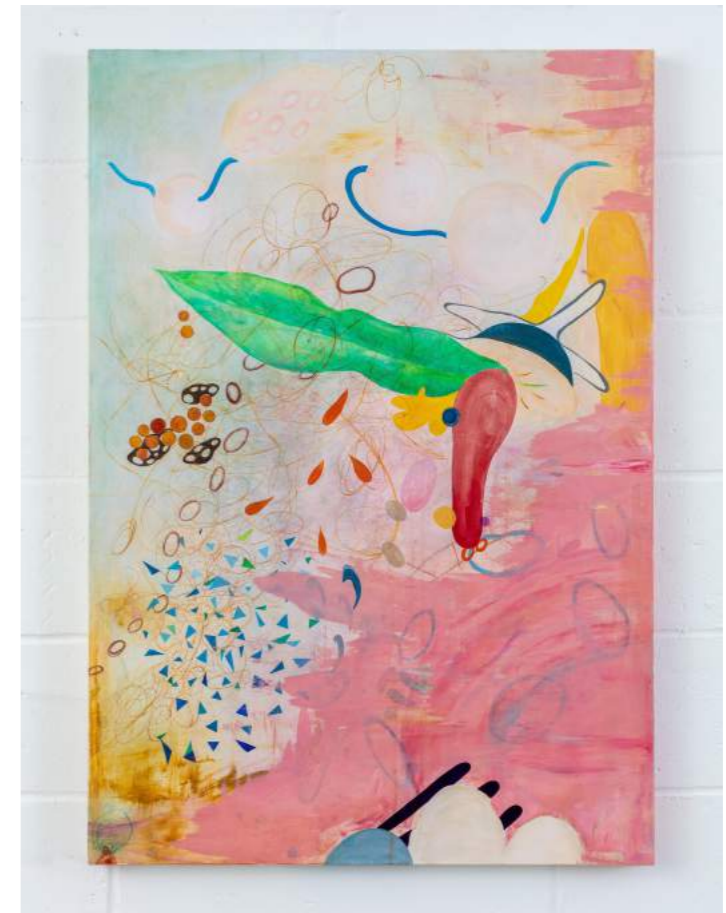
Silia Ka Tung Nepenthes , 2023 Acrylic on Canvas 114.5 x 80 cm