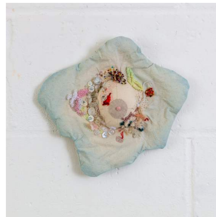
Silia Ka Tung Sunny Side Up (Love in A Mist) , 2021 Acrylic and Embroidery on Canvas, Polyfill 29 x 26 x 6 cm