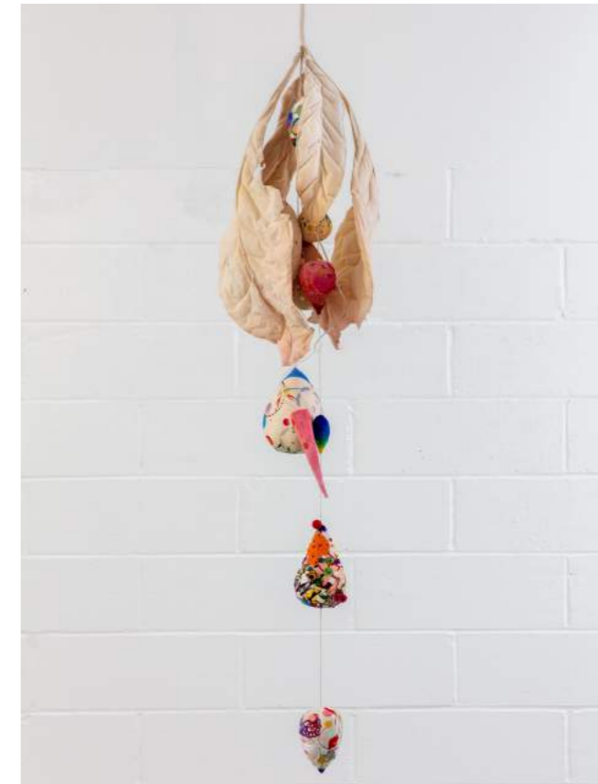
Silia Ka Tung String of Raindrops , 2024 Acrylic, Embroidery on Canvas, Polyfill, Wire 204 x 40 x 40 cm