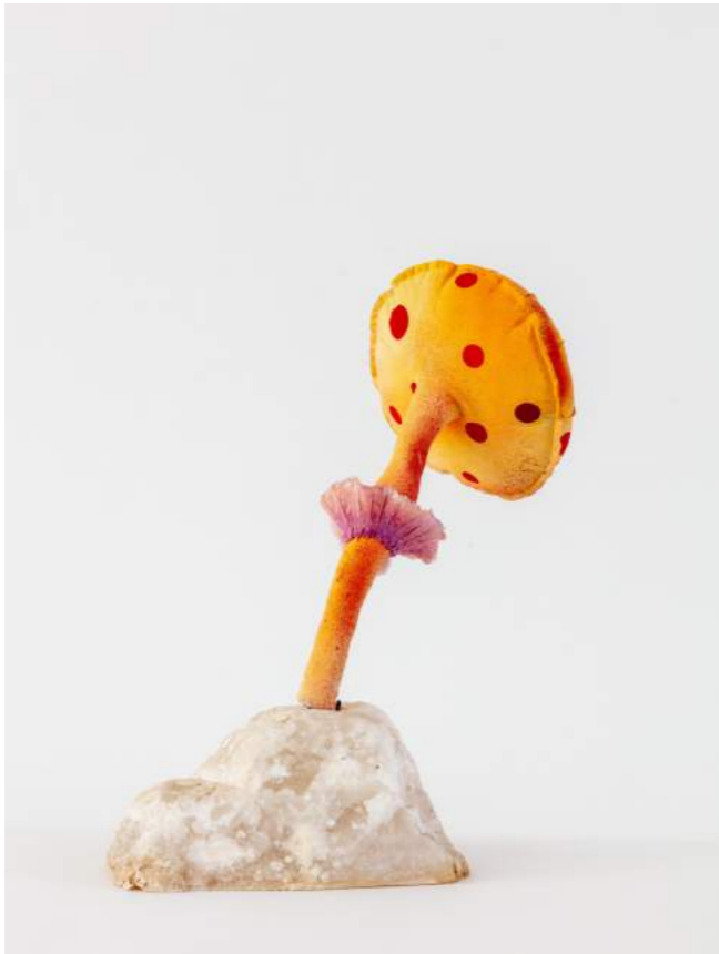
Silia Ka Tung Orange Bonnet , 2022 Acrylic on Canvas, Polyfill, Metal and Quartz 43 x 38 x 19 cm