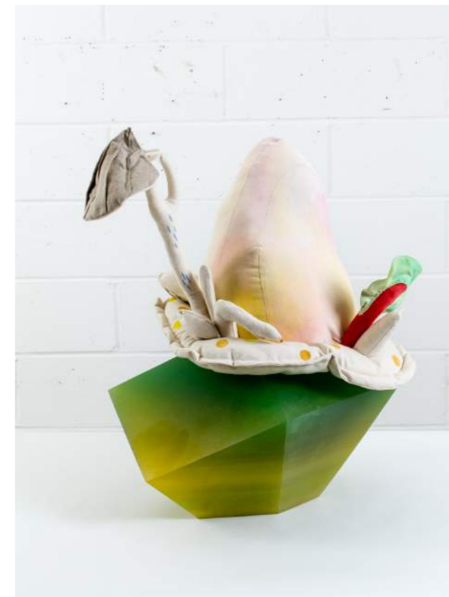
Silia Ka Tung Green Rock and the Magic Mountain , 2016 Acrylic on Canvas, Polyfill, Wire and Resin 66 x 50 x 42 cm