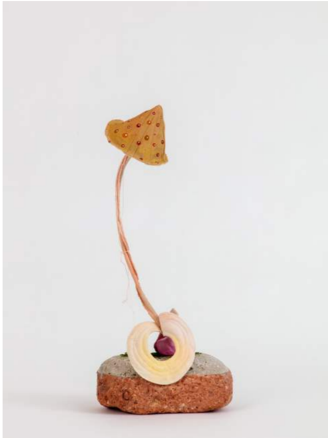
Silia Ka Tung Mr Reishi , 2022 Acrylic on Canvas, Polyfill, Wire and Brick 53 x 26 x 12 cm