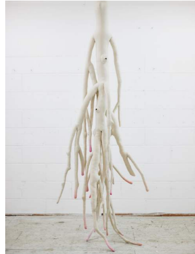
Silia Ka Tung Untitled (Tree) , 2016 Acrylic on Canvas, Polyfill, Aluminium 68 x 78 x 300 cm