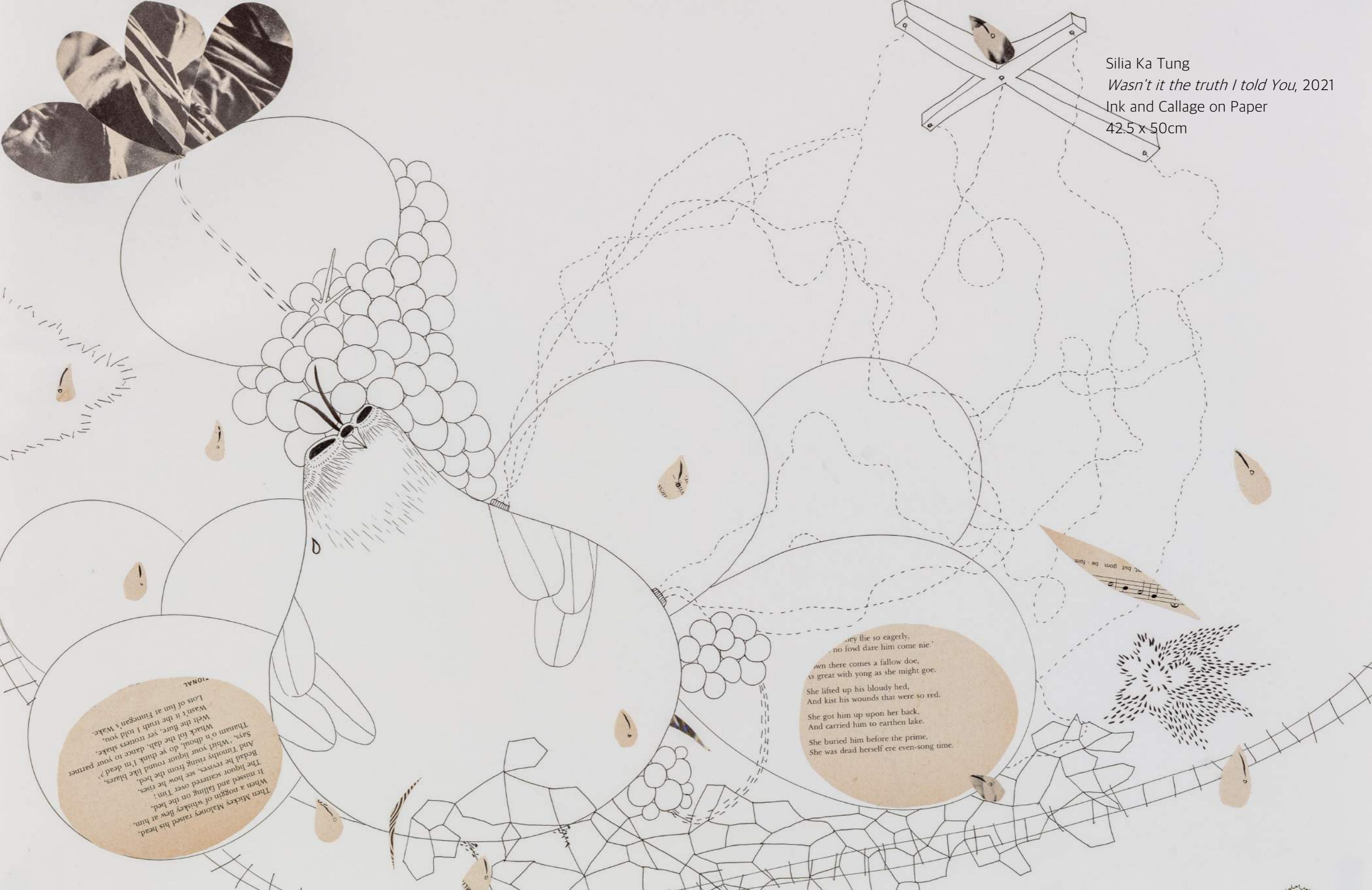
Silia Ka Tung Wasn't it the truth I told You , 2021 Ink and Callage on Paper 42.5 x 50cm