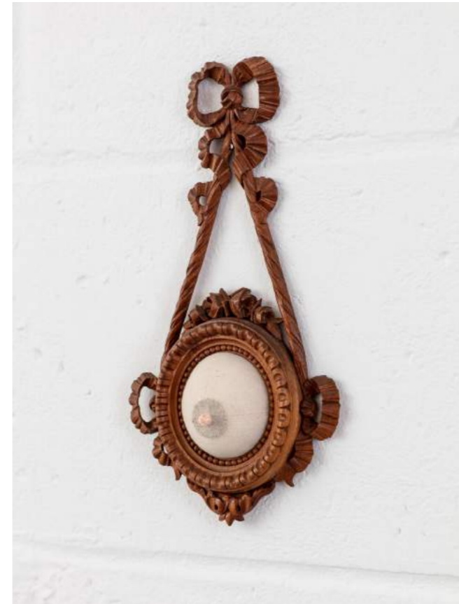
Silia Ka Tung Amazon's Ribbon , 2024 Textile, Wooden Frame 25.5 x 14 x 4.5 cm